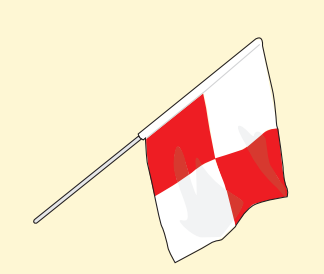
16. Emergency evacuation flag