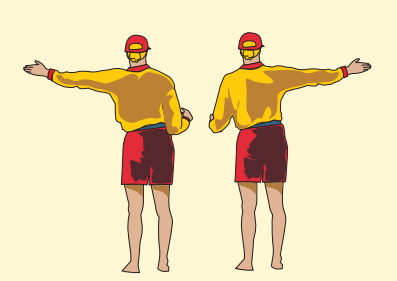
8. Go to the left or the right