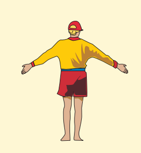
6. Investigate submerged object