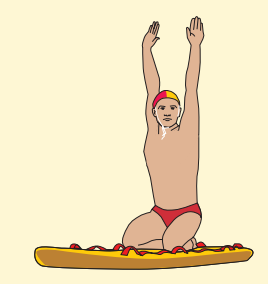
13. Emergency evacuation alarm