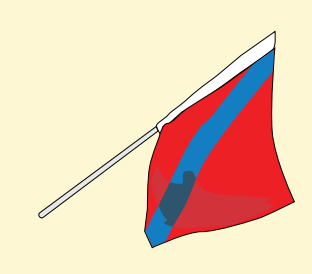
20. Signal flag

A full description of signals is available on page 119 of the 33rd Edition of the Public Safety and Aquatic Rescue Training Manual