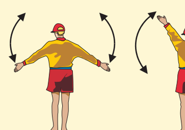
10. Pick up or adjust buoys