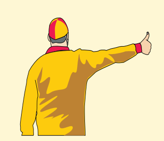
19. Helicopter signal—request to enter