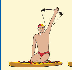
11. Assistance required

(May be conducted from any craft or boat)